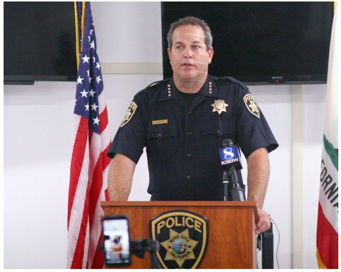
King City Chief of Police Keith Boyd discusses the arrest of three suspects connected to two murders from 2016 and 2017 during a press conference on May 27.